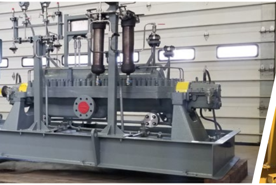
Hard to Find Rental Pumps