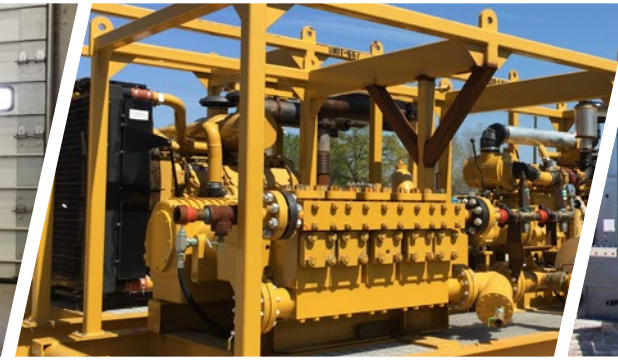
Plunger Pumps - 600-3000 PSI