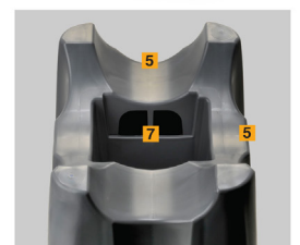
Built-In Handle for Ease of Use