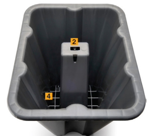
Reinforced Center Column & Saddle