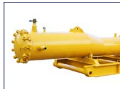
Pig Launchers and Receivers