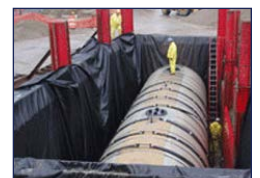
Slide Rail Systems