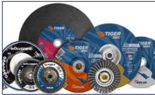
Abrasive & Cutting Tools