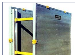
Aluminum Trench Shields