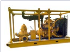
Centrifugal Fill Pumps & Jet Pumps