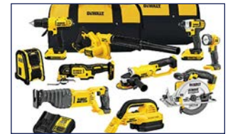
Power Tools & Parts