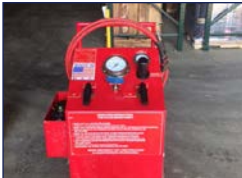
10K - 30K Hydrostatic Test Pumps