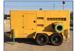
Sound Attenuated Pumps