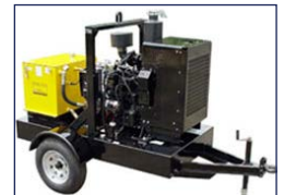
Hydraulic Submersible Pumps