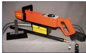
Pipe Testing Equip. & Parts