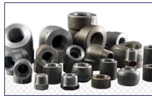
Pipe Valves, Fast. & Fittings