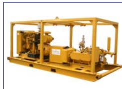
Reciprocating Pressure Pumps