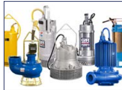
Electric Submersible Pumps