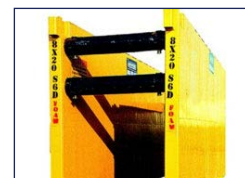
Steel Trench Shields