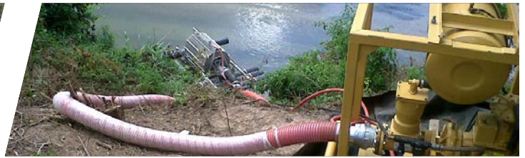
WATER & WASTE MANAGEMENT