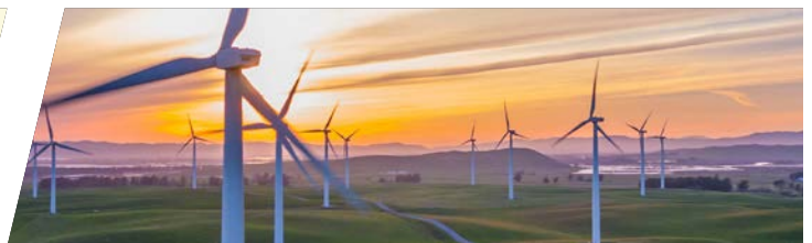
WIND AND SOLAR FARMS

Cross Country is Built from some of the Best Companies in the Industry