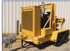
High Pressure Pumps